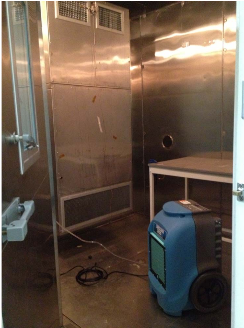
Figure 2. DRIZAIR 1200 inside test chamber