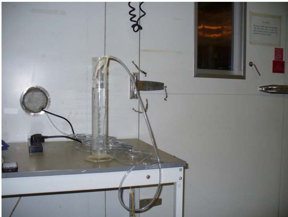
Figure 3. Water collection method