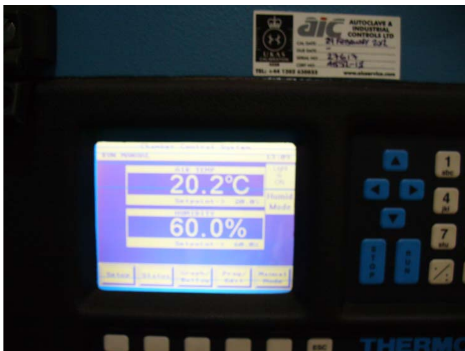
Figure 4. Test chamber control panel at test condition 1 and cal label