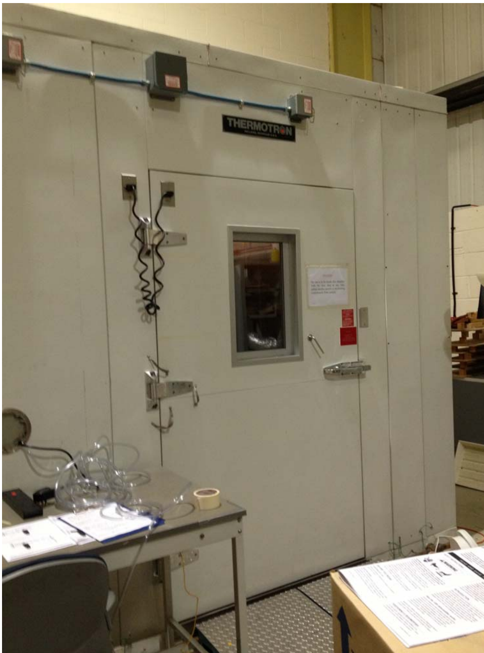
Figure 1. Outside of test chamber